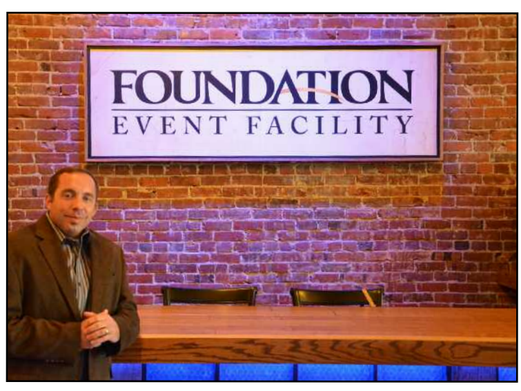
The FOUNDATION Event Facility provides catering for events at the facility, quality sound systems, high-tech lighting and HD television provided by BTES.

FOUNDATION events include live music and public events, such as the first Halloween Social in October and the first Annual Pancake Breakfast with Santa in December, with an on-site Santa's Workshop.