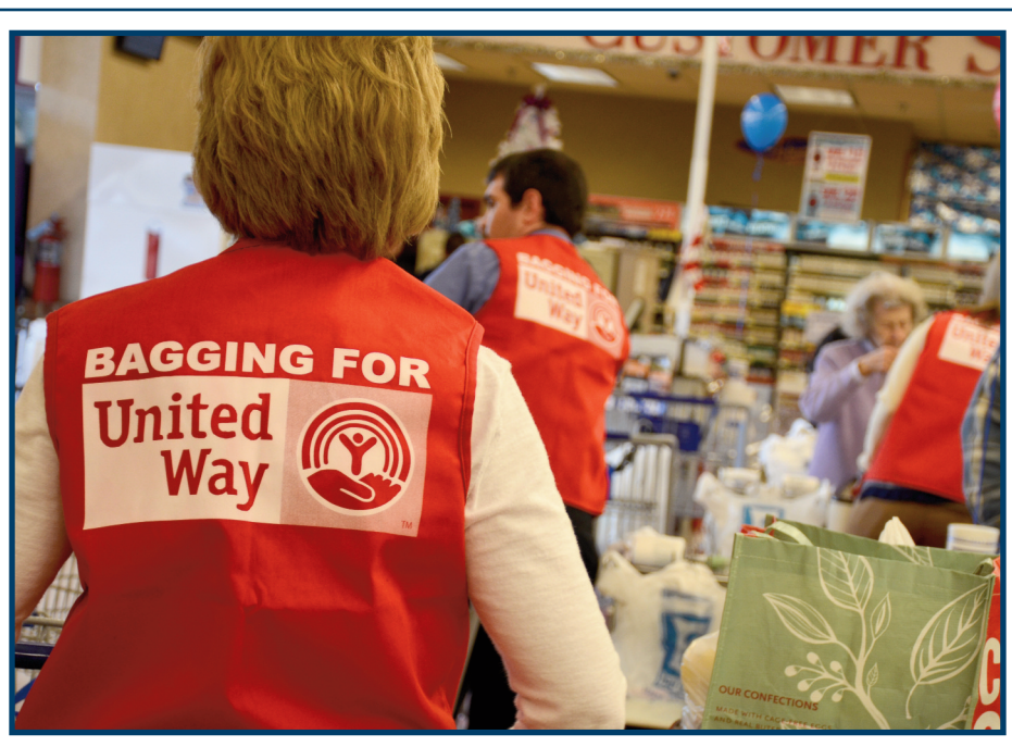
Each year, BTES employees volunteer on the Tuesday before Thanksgiving to bag groceries at Food City to raise awareness of the United Way. BTES competes with other businesses across the region to see who can raise the most money during their shifts!

This year's United Way campaign — Difference Maker — kicked off in mid-August with a $1.15 million fundraising goal.