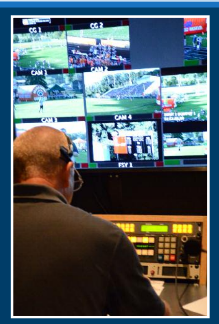
BTES Power 7's "Gridiron Gameday" features live broadcasts of area high school football games.

Additional programming has highlighted community events, area nonprofit organizations, and programs within our school systems, including local sports.