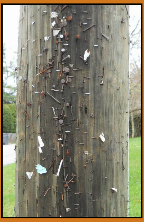
Photo of a pole in the BTES service area. Nails and staples pose a major concern for linemen.

"Always teach children not to play with or swing on guy wires, and remember to be vigilant of these wires while performing yard work or spending time outside," King said.